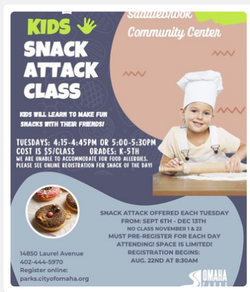
Kids Snack Attack