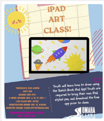
iPad Art Class