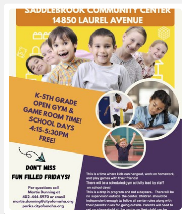
Community Center Update